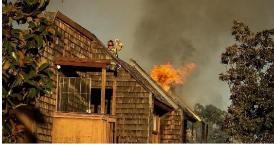
A fire damaged an apartment in Fontana.

An apartment was damaged in a fire in Fontana on Oct. 14, according to the San Bernardino County Fire Department .